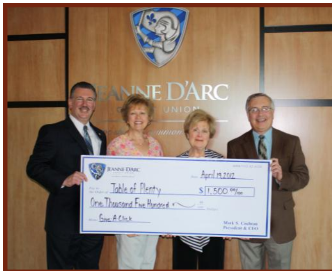
Table of Plenty in Chelmsford won Jeanne D'Arc Credit Union's (JDCU) "Give a Click Campaign"! JDCU understands the value of community and working together. On their website, community members can read about three worthy nonprofit organizations and then vote for the one they would most like to see them support. The charity with the most votes then receives a $1,500 donation. Different charities are posted every quarter, so they encourage people to keep returning to help their favorites gain a much-needed donation.