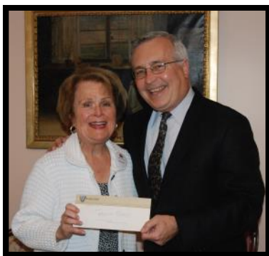
Table of Plenty has been fortunate in the past to have received a donation from Jeanne D'Arc Credit Union from their "Give a Click" campaign, where they donate $1500 each quarter to a worthy area non-profit. In addition to this generosity, in October we also received a check for $1000 from the donations Jeanne D'Arc re-