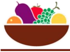
Table of Plenty in Chelmsford Newsletter