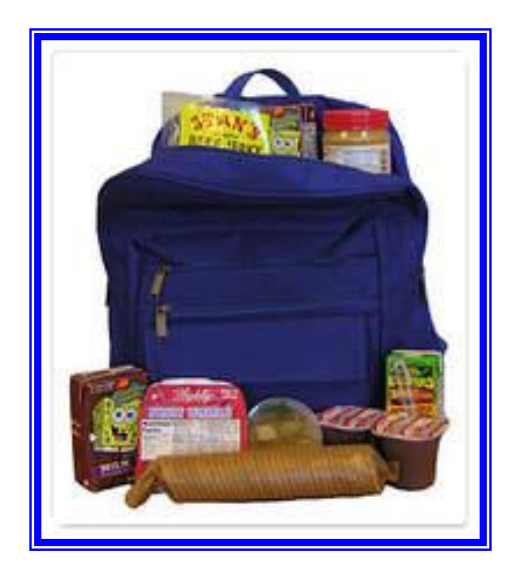
Table of Plenty will be partnering with Operation Nourish - a Children's Feeding Program run through the Merrimack Valley Food Bank. Selected students in the Chelmsford School System will receive a bag of nutritious food each week on Fridays to reduce weekend hunger.

National research shows that children who eat regular healthy meals have a greater attention span and ability to learn, exhibit higher test scores, and have fewer physical and mental health problems. An investment in children's health is an investment in our country's economic health. Children, whose bodies and brains are in their most rapid period of growth, are vulnerable to even short-term deprivation.