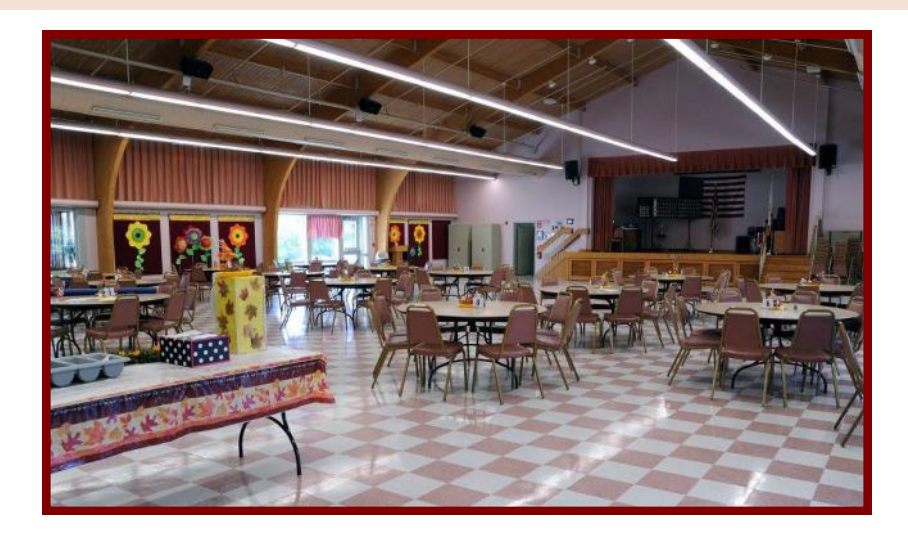
Table of Plenty Has a New Home

Last summer, Table of Plenty knew it had to move to a temporary space while the First Parish Unitarian Universalist Church was undergoing renovations. The Town of Chelmsford was gracious to offer the use of the Senior Center during this time. After many months of serving there, the Board voted to remain at this location for a number of reasons, including the size of the dining hall, ample parking with handicap accessibility, and air conditioning. We are eternally grateful to Reverend Ellen Rowse Spero and all of the wonderful people at the UUC for their commitment to Table of Plenty. We could never have gotten off the ground and served the community as we did for the past eight years without their faith and support.